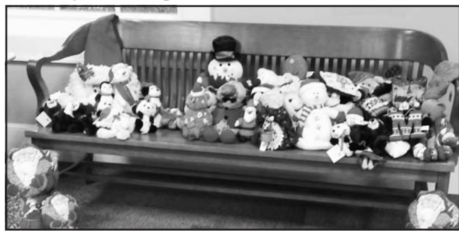
Donations for sale at our 2018 Everything Christmas Sale

Are you overwhelmed with too many Christmas collectibles, decorations, and supplies? The Friends of Union County Library would like to remind everyone that collection will soon begin for our 2nd "Everything Christmas" fundraiser. Volunteers will be accepting donations of all reusable Christmas items every Thursday and Saturday in October. Collection is inside the Union County Public Library in Blairsville between 10 AM and 1 PM. There will also be a donation box available just outside the Friends Room in the library for leaving Christmas-related items whenever the library is open throughout October.