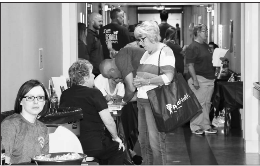
The Health Fair featured plenty of free services and information for area residents to peruse on Saturday.

Health Fair started at 6 a.m. The results of the blood testing will be mailed to participants at their home addresses and sent to their primary care physicians if they chose that option.